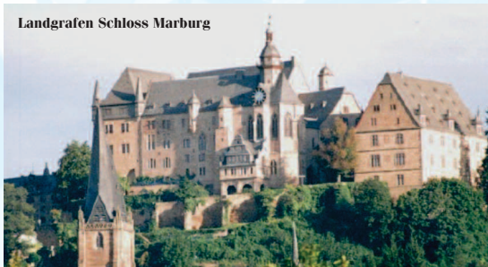
Landgrafen Schloss Marburg

on Landgrafen Schloss Marburg Friday, 16 th May 2008, 07:30 p.m.